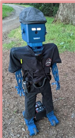
New TA – Bezael (AI Robot built by KO6XX)