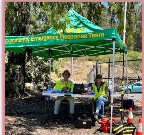
ARES and CERT manning the command post

This was the first time using Aptos High School and it again encompassed a much larger footprint for perimeter monitoring. The campus is nestled into the Aptos hills and housing developments on both sides of the campus. Prior years the event had been at San Lorenzo Tri-campus School (elementary, junior high and high school), Scotts Valley High School and UCSC. Similar to last year, this year had some additional activities on-going during the same time as the event at the campus location. This included construction, athletics practice, maintenance crews and teachers getting ready for the upcoming year. New this year was a bumper crop of poison oak and a skunk spontaneously volunteering to manage the main gate and keeping away the additional unwanted visitors.