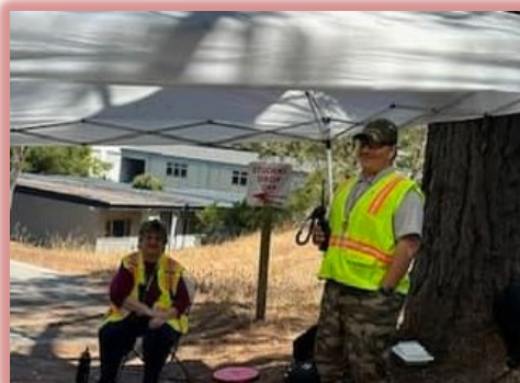
First-time and experienced volunteers share a post

Radio communications were via MURs and rented public safety radios. Health and welfare checks for each volunteer on site were completed at least every half hour by a designated radio operator. The Active Shooter event logistics coordinator provided additional communications via the public safety radio to the teams. Each team had to acknowledge these communications. This included scenario initiation and cessation. After signing in and a briefing by the shift lead, the perimeter monitor volunteers were paired up (when staffing allowed) and sent to one of five locations. The shifts (4 – 5 hours long) overlapped to allow time for the briefing and transition of volunteers at each of the posts. Sheriff officers in a roving gator utility vehicle augmented the perimeter monitoring posts.