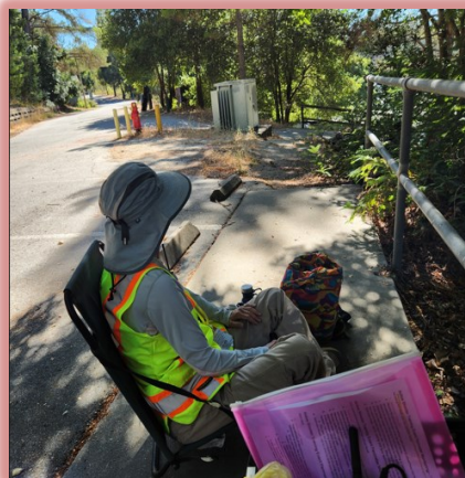
Monitoring the back side of campus