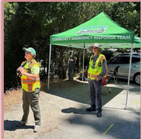
What is that in the sky—drone or bird?

The planning team hopes next year you will consider volunteering (first time or again) for this satisfying event.