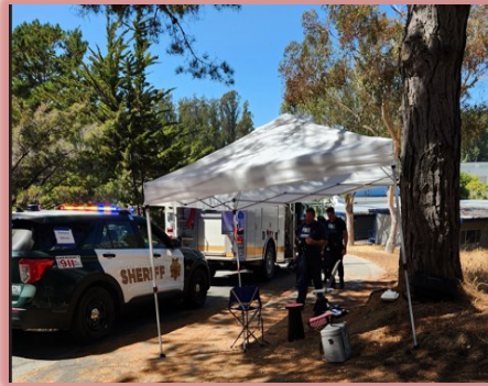
Vehicle parking during scenario

It was interesting to find out that the responders leave the vehicles running, 'just in case' of needing to exit quickly. This provided a challenge of extra noise during the afternoon shift at this location.