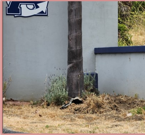
A spontaneous volunteer?