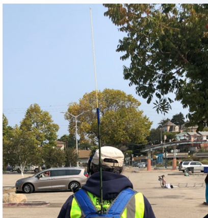
Figure 1—KM6NEP at SC triathlon