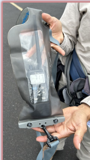
HF HT Icom M-73 used by crew in its water proof case (it rains a lot here!)