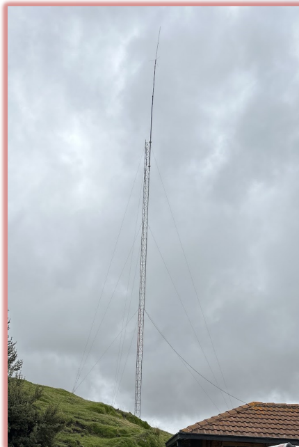
A repeater in the Highlands at 12,500 feet