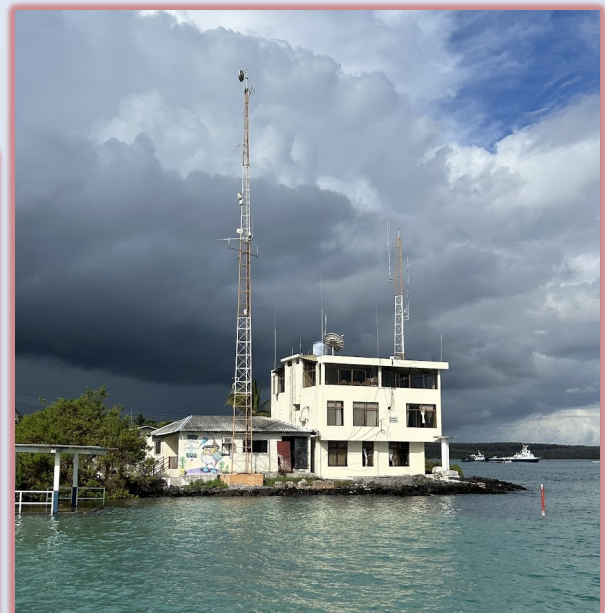
Harbor Authority at San Cristobal