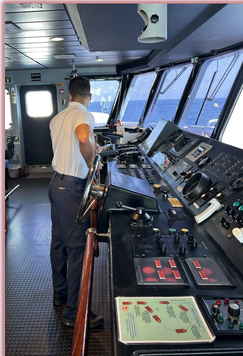
Bridge of the National Geographic Endeavor 2