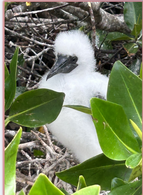
Baby Booby bird