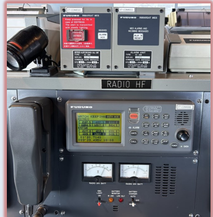
HF radio used to communicate between crew and ports