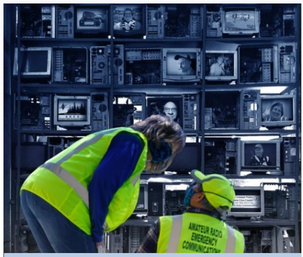
Who do you recognize in this picture? Check pg 4

We will continue to meet over zoom for the time being. Is the redesign already set? No, ARES members will be receiving a survey after the April meeting to solicit additional thoughts and improvements.