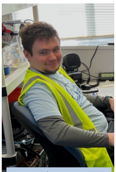
Christian / A3CT Net Control